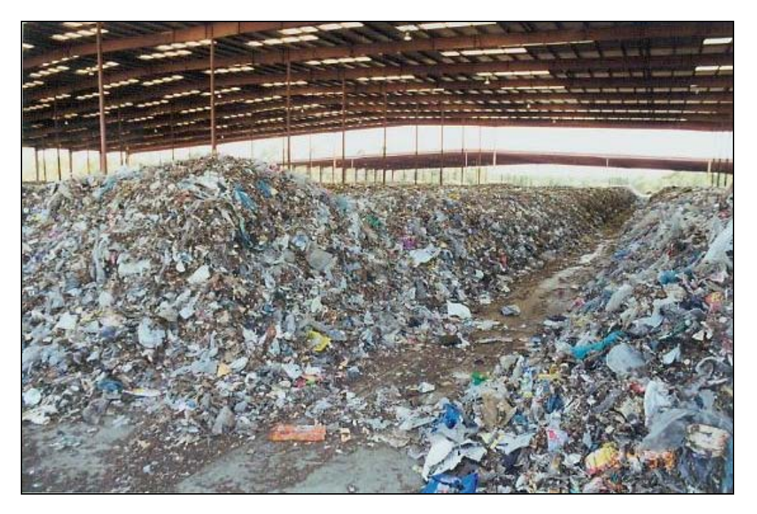
Inappropriate technology for feedstock and poor odour control